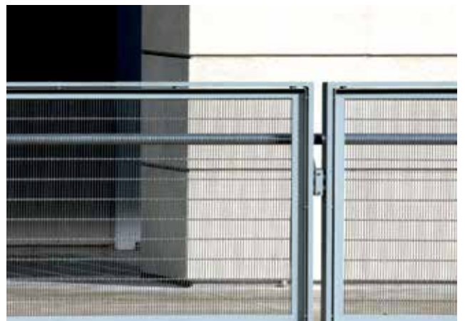
Title + image 4: The Art Institute of Chicago, Illinois, architect: Renzo Piano, France, mesh: PC-Tigris